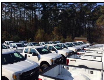
New F-250's behind shop in Charlottesville