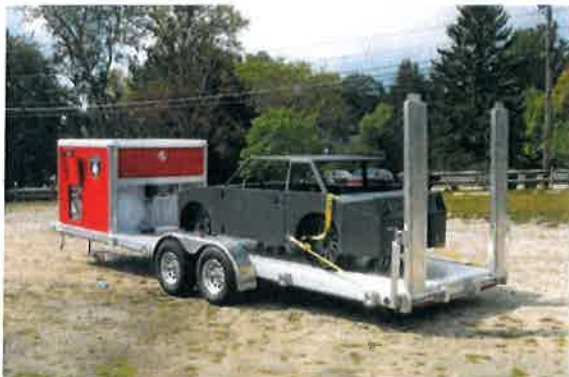
car prop on trailer with propane storage tanks

Kidde Fire Trainers, LLC 17 Philips Parkway Montvale, NJ 07645-1810 USA Tel +1 201-300-8100 Fax +1 201-300-8101 info-us@kiddefl.com www.kiddefl.com