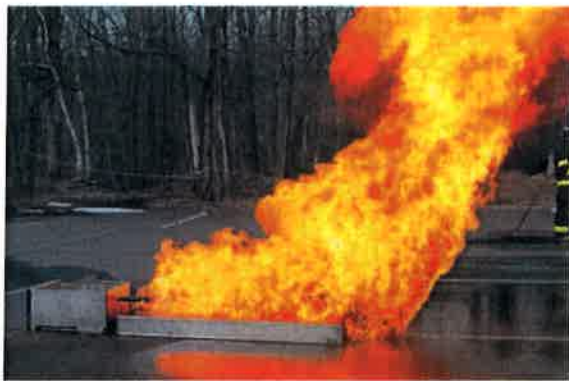
Hose Line FIRETRAINER® O-100