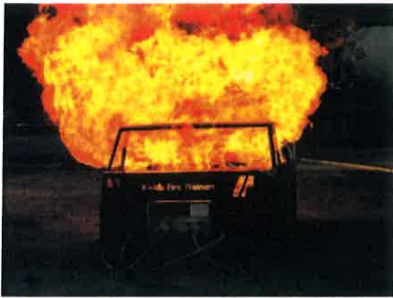
fully involved car fire